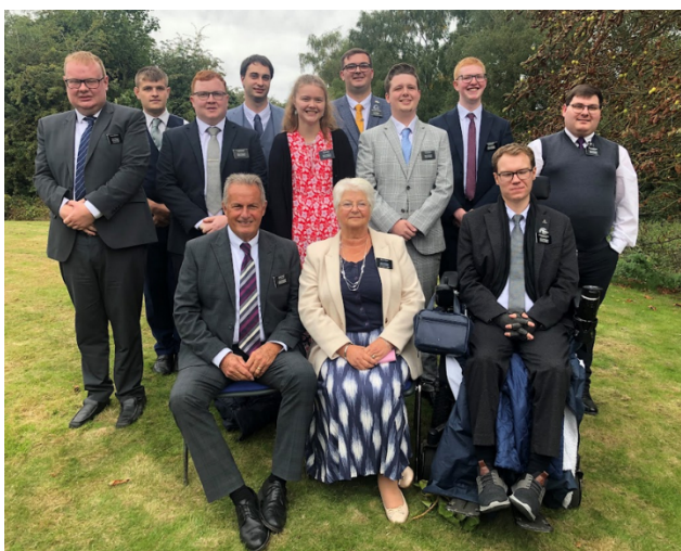
Bristol and Birmingham Service Mission