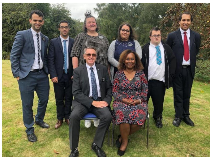
London Service Mission