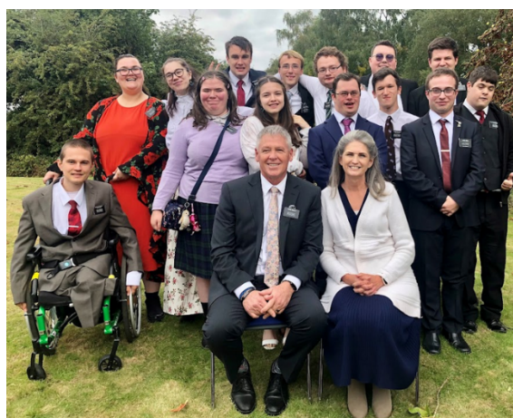
Manchester, Leeds, Scotland and Ireland Service Mission